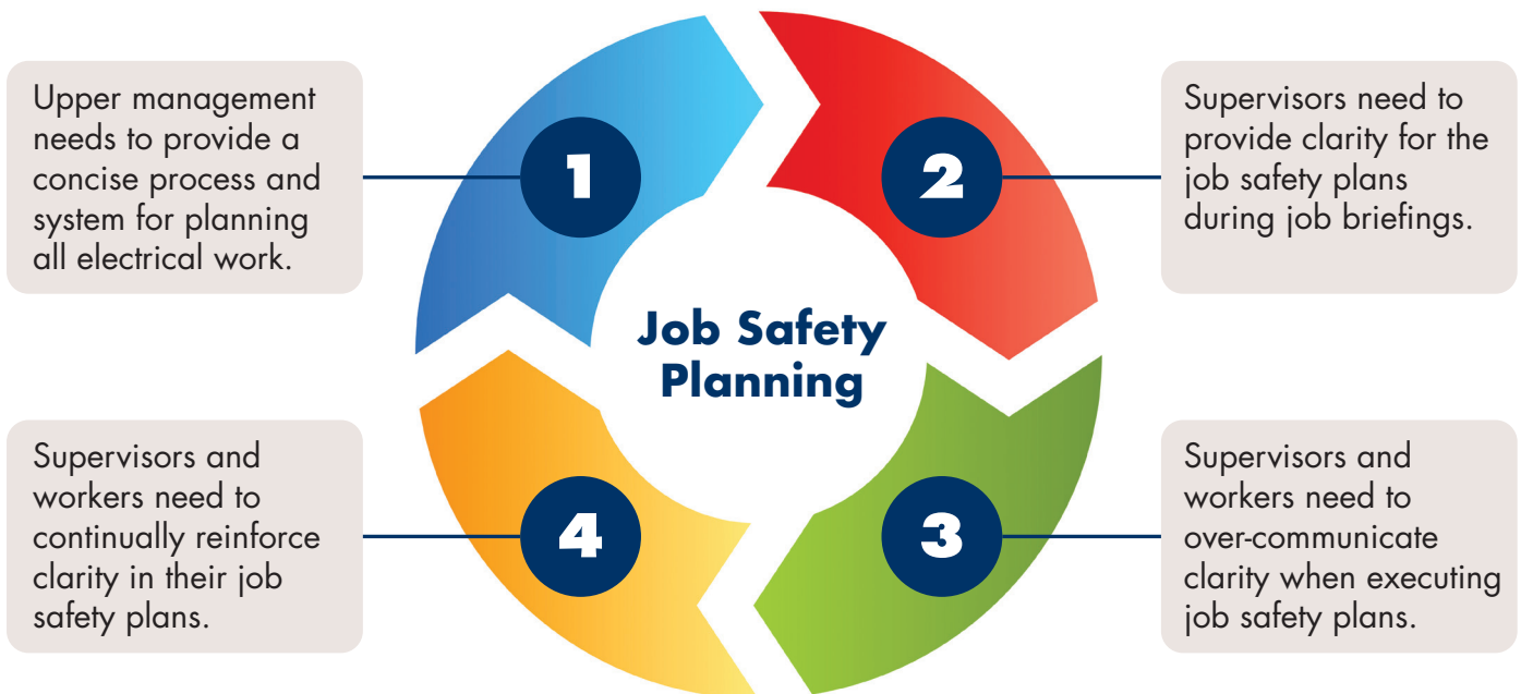
Figure 2: Job Safety Planning Cycle (Adapted from “The Advantage: Why Organizational Health Trumps Everything Else in Business,” by Patrick Lencioni)

CLARITY NEEDS TO BE THE FOUNDATIONAL VALUE USED BY ELECTRICAL MANAGERS, SUPERVISORS, AND WORKERS WHEN EXECUTING A TASK.